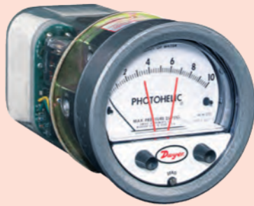
Set points are instantly adjusted with front knobs.