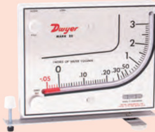
Mark II Model No. 25 inclined-vertical manometer. (shown with optional A-612 portable stand)